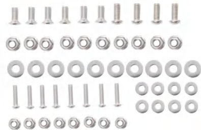
Bolt & Nut & Washer